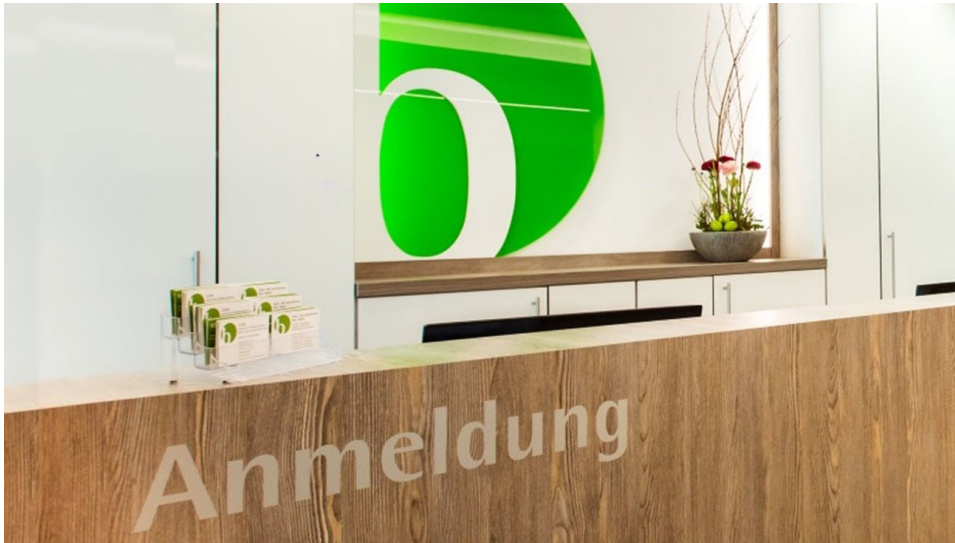
Caption 1: MVZ Haut- und Laserzentrum Würzburg.